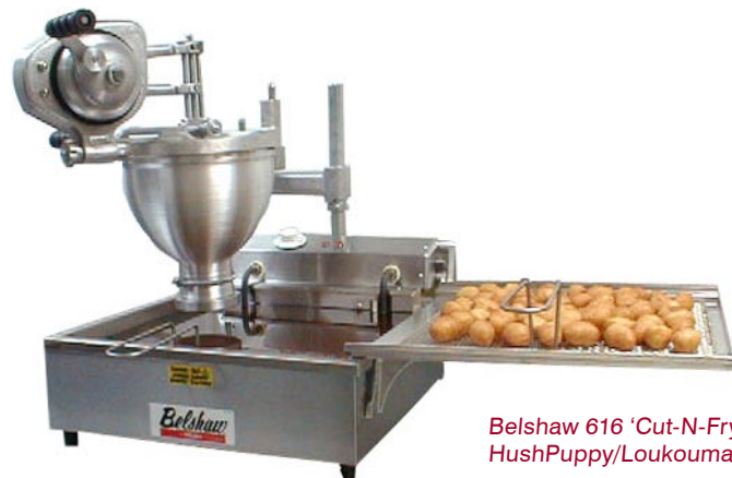
Belshaw 616 'Cut-N-Fry' for HushPuppy/Loukoumathes

This versatile combination enables bakeries and others to fry cake and raised donuts in less than 3 feet (1m) of counter space up to 35 dozen donuts per hour, ideal for fast production during slack periods. Using Belshaw's full-featured Type 'N' Donut Depositor, it can make multiple varieties of cake donuts with Belshaw plungers and attachments.