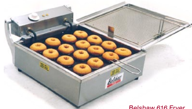
Belshaw 616 Fryer

The 16" x 16" kettle area has room for 16 donuts at a time. The Cut-N-Fry is constructed with durable, sanitary materials. The heavy duty element tilts out of the way, and the readily removable hopper and kettle facilitate cleaning.