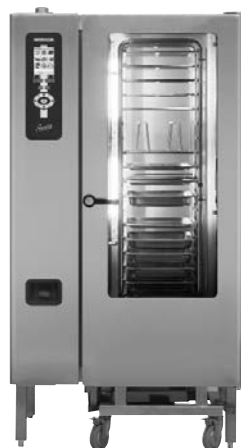
GENIUS T 20-11