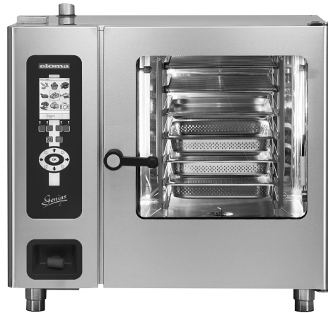
GENIUS T 6-11