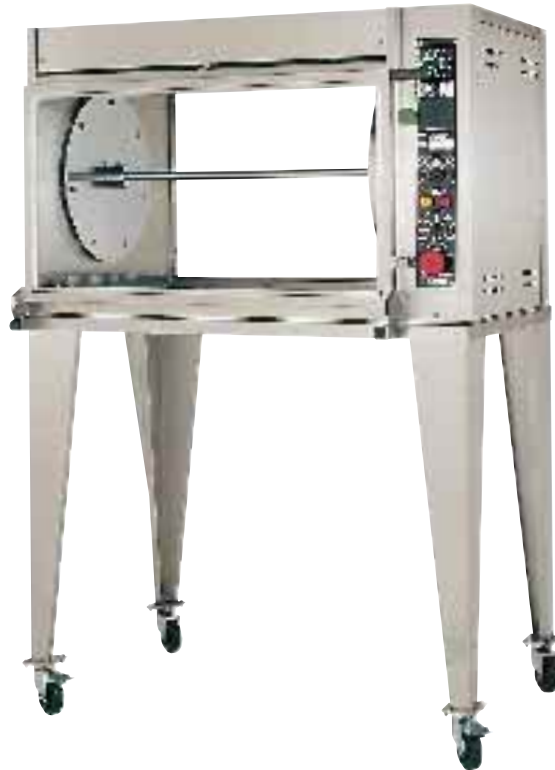
The Excalibur model shown above includes optional fixed glass back and casters.

Fixed stainless steel/aluminum back Fixed infrared reflective glass back Pass through door with infrared reflective glass Casters 6,7 or 8 spit drives (at no additional cost) Water & Gas quick disconnect kits Smoker attachment